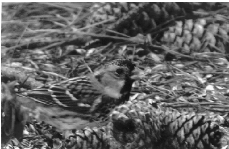
Figure 1. Adult Harris's Sparrow at Henne residence, Attala County, Mississippi. Photographed 29 December 2004 by John Fahnestock.

Fahnestock of Ocean Springs. During their visit John took the photo of the Harris's Sparrow shown below in Figure 1.