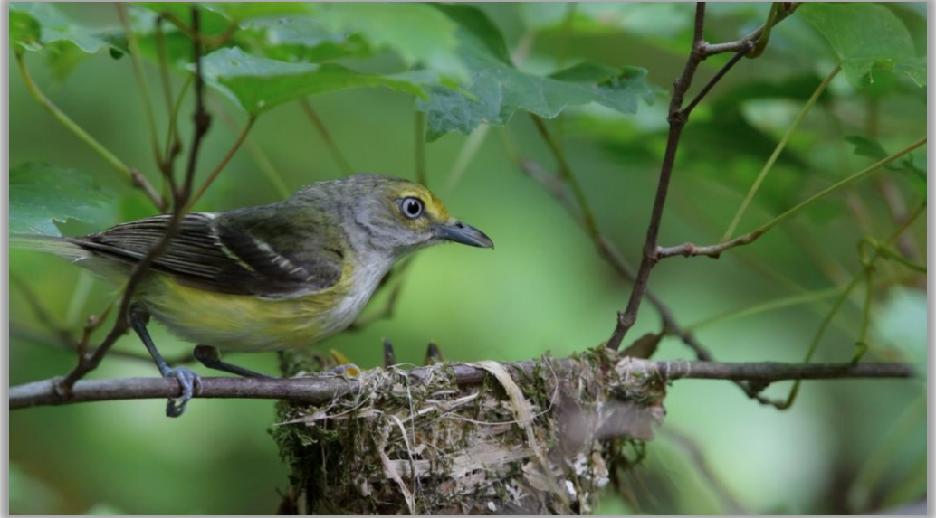
Figure 1. White-eyed vireo nest at Strawberry Plains Nature Center near Holly Springs, MS, on July 1, 2018

It was situated approximately 1.5 meters from the ground in a muscadine vine ( Vitis rotundifolia ).