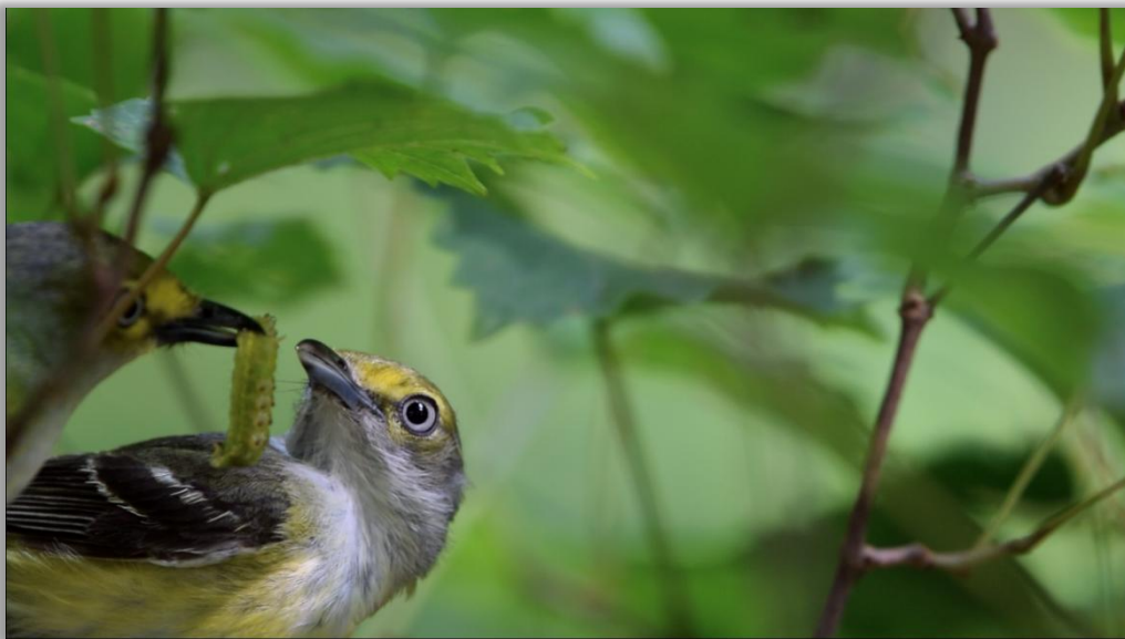
Figure 2. White-eyed vireo adult passing food item to another adult to feed nestlings

On July 1, 2018, we audio and video recorded the nest for approximately 1 hour. Four nestling feedings and a fecal sac removal were captured during that time and can be viewed at: https://youtu.be/pwJGiKbZMT0 . One interesting observation occurred during the first visit when one adult passed food to the other adult to feed the nestlings (Figure 2).