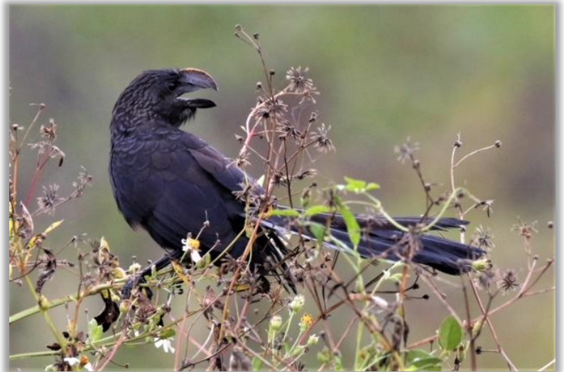
Smooth-billed Ani - Hiller Park, Biloxi, MS (first sighted 11/4/17)