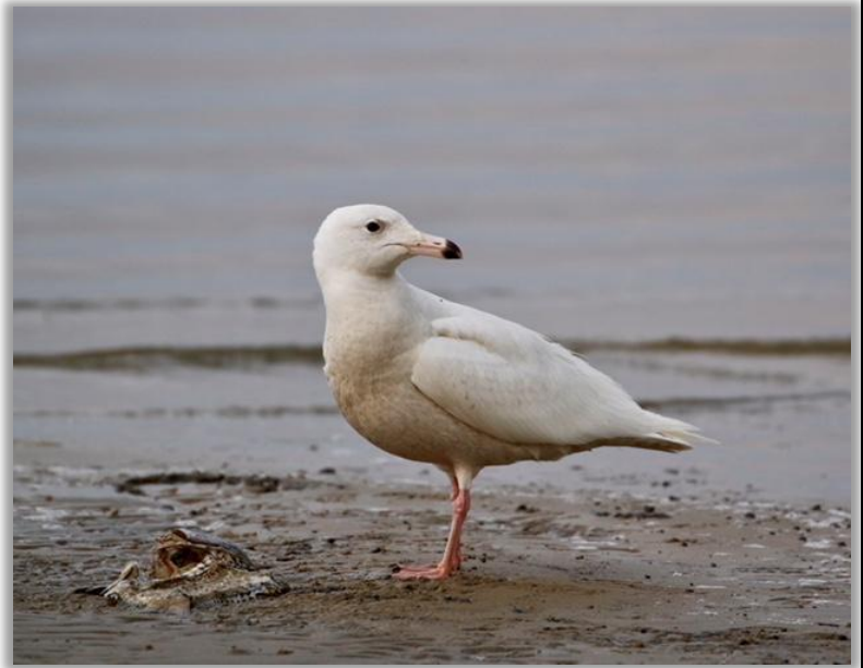
Glaucous Gull - Pass Christian Harbor, MS (first sighted 2/24/18)