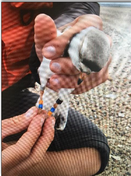
Summer 2017 re-band