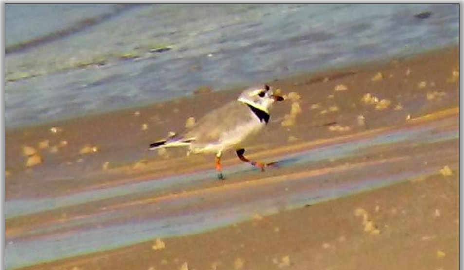
Banded Piping Plover on Ocean Springs Front Beach, April 2018

While conducting a spring ACBS survey on April 12, 2018 in Ocean Springs, Mississippi, a Canadian male, banded Piping Plover was resighted. The bird was loafing in a sand berm created by a beach raker along the high tide line at Front Beach. The coordinates of the bird were: 30.409088, - 88.838610. The band combination was: upper left black flag, lower left blue over orange, upper right metal, and lower right orange over blue. The bird was originally banded as a chick in 2005, by Dr. Cheri Grotto-Trevor with Environment and Climate Change Canada / Government of Canada.