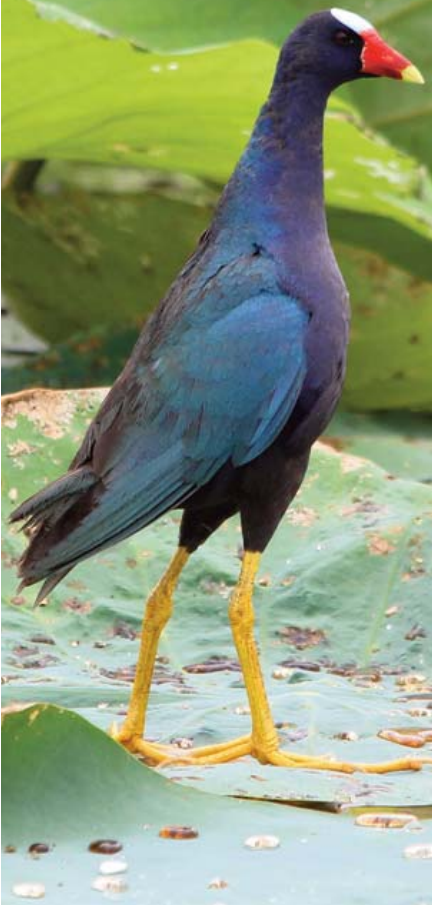
Purple Gallinule