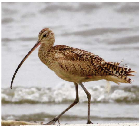
Long-billed Curlew • Holly Cox