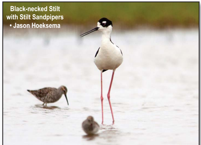
Black-necked Stilt with Stilt Sandpipers