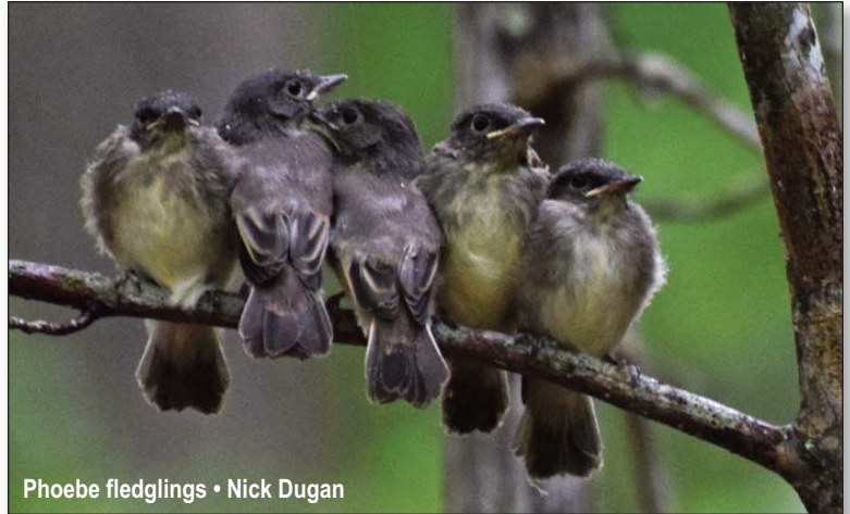
Phoebe fledglings • Nick Dugan

Orchard Oriole Baltimore Oriole House Finch Pine Siskin A. Goldfinch House Sparrow Total Species 125