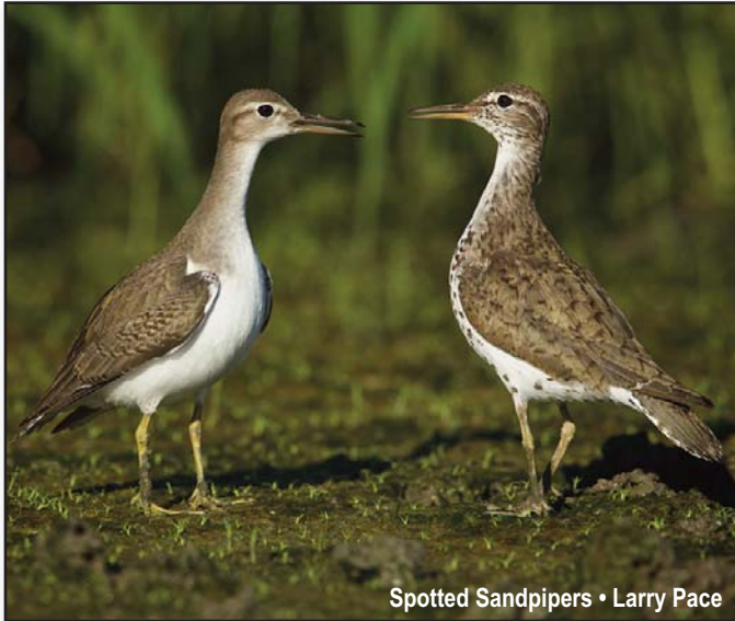
Spotted Sandpipers • Larry Pace