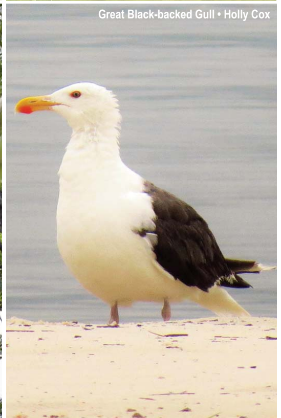
Great Black-backed Gull • Holly Cox