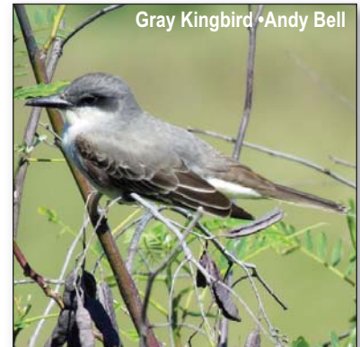
Gray Kingbird