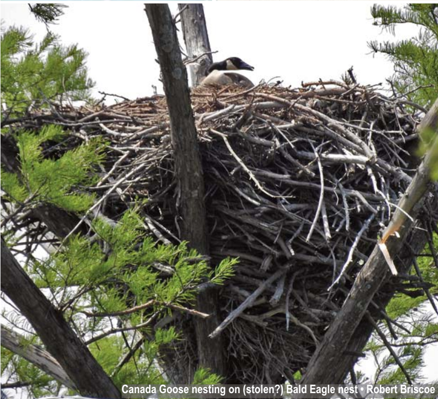
Canada Goose nesting on (stolen?) Bald Eagle nest • Robert Briscoe