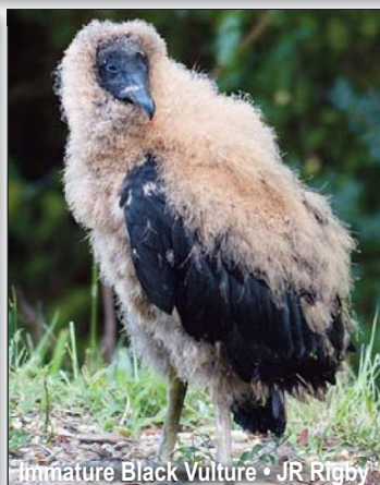
Immature Black Vulture • JR Rigby