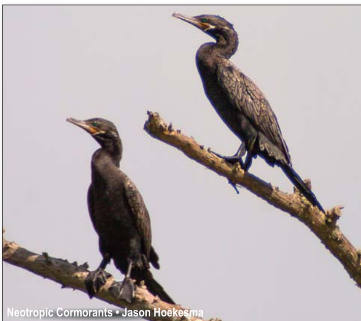
Neotropic Cormorants

the winter months. A second Say's Phoebe was found at the South Farm at Mississippi State University on 1 January and remained on site into March. A first cycle Thayer's Gull was a good find in Hancock County on 8 January. On 18 January a male Bullock's Oriole (possibly the same individual from last year) was present in Ocean Springs and seen into March. The Ballentine area of Panola County hosted 500+ Sandhill Cranes again this winter. An immature female Baltimore Oriole survived the February sleet and snowy weather this winter in Lafayette County and was present into March. A second Oktibbeha County record of Western Meadowlark was also found at the South Farm at Mississippi State University on 24 January.