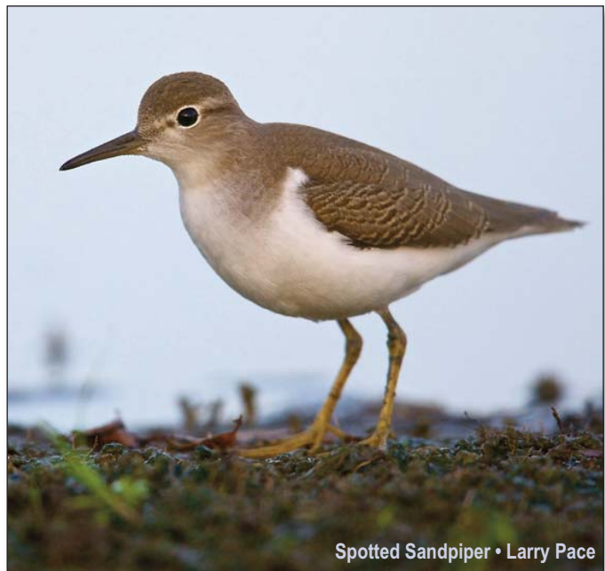
Spotted Sandpiper • Larry Pace

Red-headed Woodpecker Red-bellied Woodpecker Downy Woodpecker Hairy Woodpecker Northern Flicker Pileated Woodpecker Peregrine Falcon Eastern Wood-Pewee Loggerhead Shrike White-eyed Vireo Blue Jay American Crow Tree Swallow N. Rough-winged Swallow Bank Swallow Cliff Swallow Barn Swallow Carolina Chickadee Carolina Wren Bewick's Wren (Review Species) Eastern Bluebird American Robin Northern Mockingbird Brown Thrasher European Starling Louisiana Waterthrush Blue-winged Warbler Black-and-white Warbler Prothonotary Warbler Common Yellowthroat American Redstart Magnolia Warbler Yellow Warbler Scarlet Tanager Northern Cardinal Blue Grosbeak Indigo Bunting Painted Bunting Dickcissel Red-winged Blackbird Eastern Meadowlark Common Grackle Brown-headed Cowbird Baltimore Oriole House Sparrow Species Total: 94