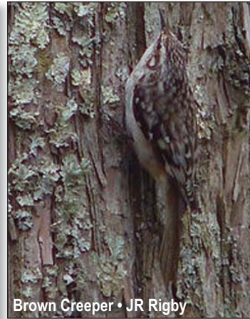
Brown Creeper