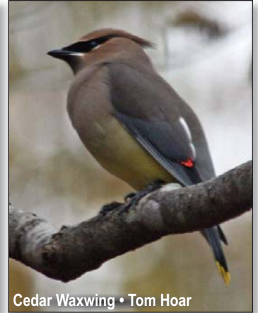
Cedar Waxwing