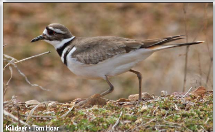
Killdeer