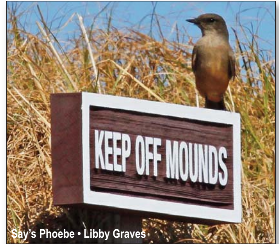
Say's Phoebe • Libby Graves

The Fall season began on schedule with Buff-breasted (3 Aug) and Upland (6 Aug) Sandpipers spotted on the A&D Turf Farm, Lafayette County. A Western Kingbird on 4 Aug was early in Hancock County as was an adult Great Black-backed Gull on the 17th in Jackson County. Two male Black-throated Green Warblers on 14 August were early in Lafayette County. Neotropic Cormorants , White-faced and Glossy Ibis are now common at St. Catherine Creek NWR, Natchez as double digits of these species were seen in August and September. Notable were 10 Marbled Godwits in Sunflower County on 4 September and 3 Red-necked Phalaropes west of Greenwood on 19 September. Black-billed Cuckoos made unprecedented appearances this fall as singles were spotted on 14 September in Lafayette County, 15 October in Hancock County, and 17 October in Bolivar County. Two Cave Swallows were found at the Seaman Road Sewage Lagoon,