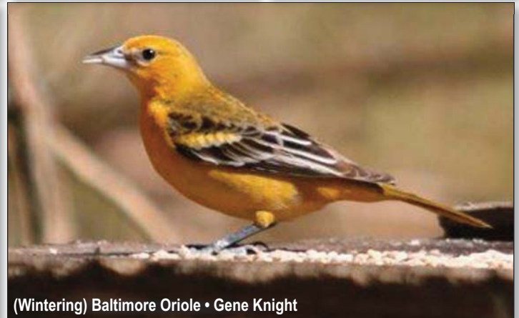
(Wintering) Baltimore Oriole • Gene Knight