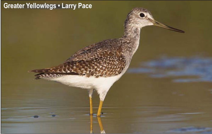
Greater Yellowlegs • Larry Pace

MOS members are invited to submit photos for publication in the Newsletter. Send to gsknight@hughes.net . See page 2 for details!