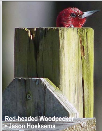
Red-headed Woodpecker • Jason Hoeksema