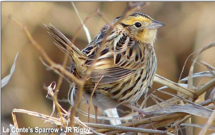
Le Conte's Sparrow