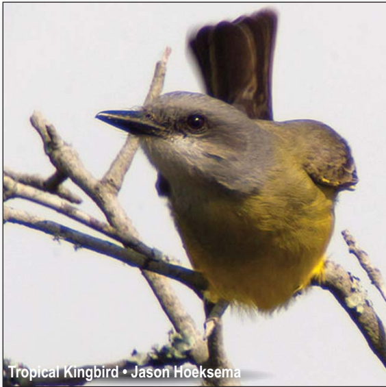
Tropical Kingbird

Jackson County on 16 Oct. A very rare Say's Phoebe was found on West Ship Island on 24 October and upon returning two days later with another birder the state's first SAGE THRASHER was seen as well as the phoebe. Photos document these two accidentals. Both birds were seen again on 31 October. 200+ Franklin's Gulls were seen at Sardis Dam, Panola County on 26 October. On November 9 a female Surf Scoter was spotted on Oktibbeha County Lake and on the 11th at the same locale the county's first Western Meadowlark was found. The first Burrowing Owl seen in the state in 10 years was present on the famous Buck Island Road in Tunica County 11-14 November. Also on this road a dark morph Rough-legged Hawk was seen 15-24 November. The Panola County Sprague's Pipit found last winter returned on 24 November 2014 and continues into February 2015. Another first state record TROPICAL KINGBIRD was found on the Hancock County CBC 16 December. It was present into February 2015. Female C. Mergansers made a show this winter as a single was seen at Sardis Dam, Panola County 18 November through mid December. At the same time, from 20 November 2014 and into February 2015, two females were present at Oktibbeha County Lake. Pacific and Red-throated Loons first seen on 26 December continue to be found at Bay Springs Lake, Tishomingo County into