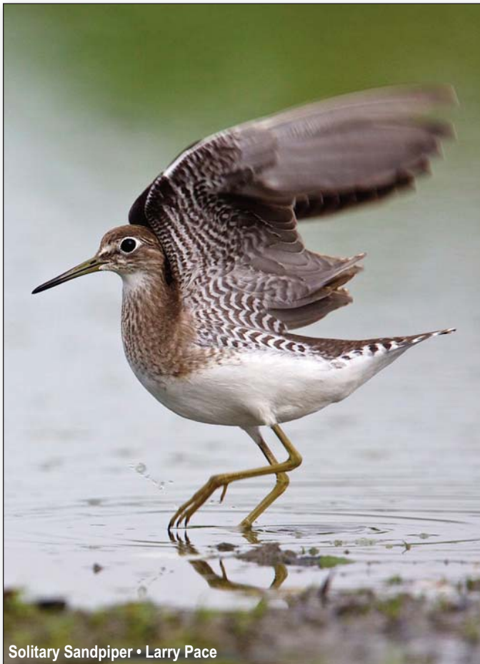
Solitary Sandpiper