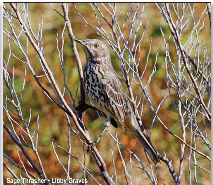
Sage Thrasher • Libby Graves