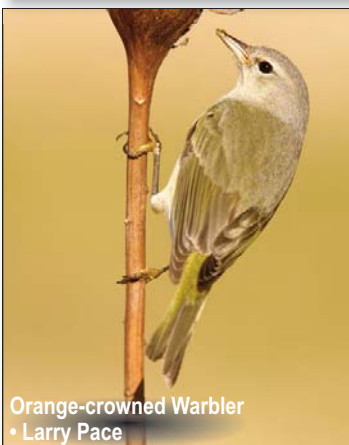
Orange-crowned Warbler • Larry Pace