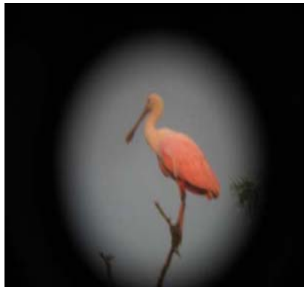
Roseate Spoonbill at St. Catherine NWR 8-10 August, 2003